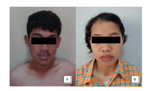
Figure 2. The front facial image of full mutation male (A) and female (B) on the latest FXS screening. FXS clinical stigmata found on the male patient such as long face and prominent ears, while no dysmorphism was observed in the female patient.

A high rate of FXS cases were found from the first screening in a special school and nearby community of Semin district, of Gunung Kidul regency, province of Yogyakarta in 2000 (20). Screening from a special school revealed 21 out of 47 students (45%) were identified and affected with FXS. After cascade testing was performed, there were 16 nuclear families with 25 affected males,