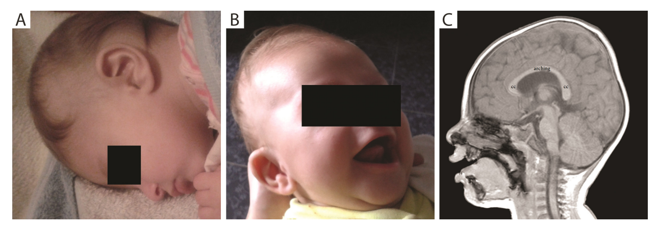
Figure 1. (A), The lack of hair (alopecia) in the left parieto-temporal area; (B), The lack of hair (alopecia) in the right parietotemporal area, the head alongated in the vertical axis and the low-set ears; (C), The head elongated in the vertical axis and deformed corpus callosum - CC (MRI, sagittal plane). CC deformation is expressed in arching of the middle part of the CC.