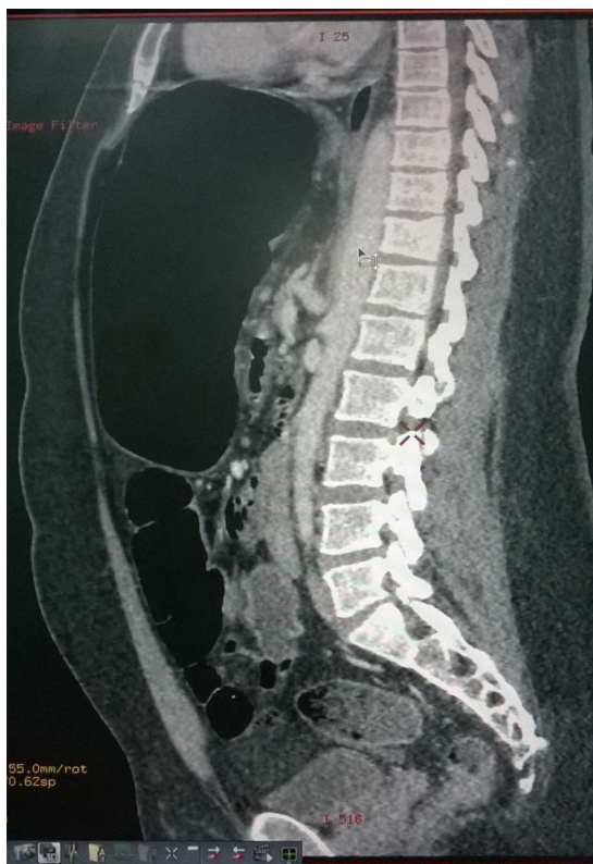
Figure 2. CT image of sigmoid volvulus in Case No. 4.